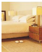
Hotels and Hospitals