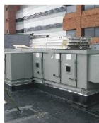
Air Handling Units