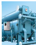
Hot Water Fired Chillers